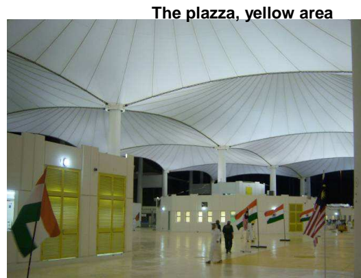
The plaza, yellow area

The Plaza, which is a huge waiting area for pilgrims , has been redesigned with retail, rest and pray areas able to accommodate 400 people each.