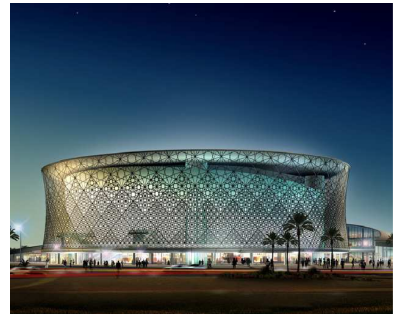
Grand théâtre in Algiers, night view.

Ergonomic and user-friendly, the site benefits from an original presentation with 5 pop-up menus offering a transverse view of all the contents through ADPI's baseline: "ADPI worldwide solutions from airport design...to city developments".