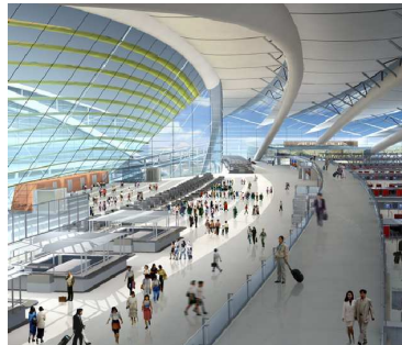
Chengdu Shuangliu airport, inside view of terminal project