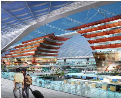
Kunming airport, inside view of terminal project

For the first time, some bold projects presented at competitions are also exhibited such as the futurist concept of the terminal at Kunming airport in China, the extension at Chengdu Shuangliu or the moon-crescent shaped Grand Théâtre in Algiers.