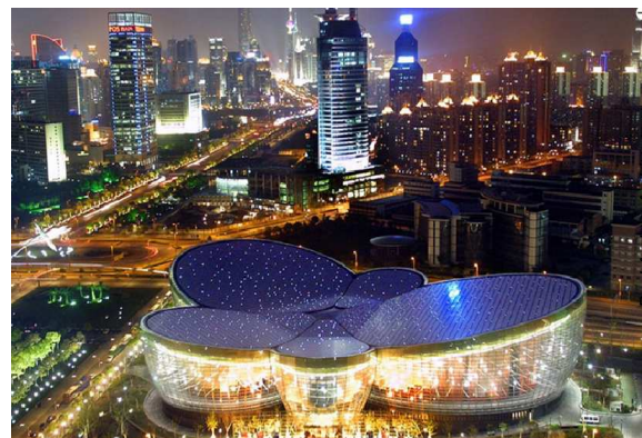
Shanghai oriental arts center